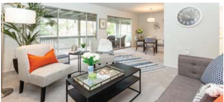
1156 Running Springs Road, Rossmoor - $425,000 2 Bed | 1 Bath | 1,054 Sq. ft.

Sunny upper Sequoia Wrap with views! This 2 bedroom corner unit has been freshly painted, popcorn removed, and new carpet installed. Laundry in unit and wrap around deck outside. One designated covered parking place with storage. Rossmoor is an active community for 55+ years young.